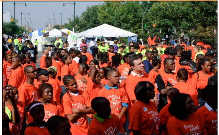
Several hundred youth (local and citywide) gathered at the Auburn Gresham 79th Street Renaissance Festival in support of an anti-violence campaign as part of NBA Basketball superstar and Olympian Gold Medalist – Dwayne Wade's Foundation: Every Child Deserves a Shot at Life.