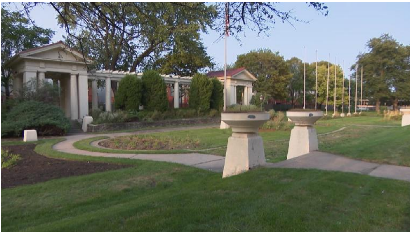
(/2021/02/04/ask-geoffrey-sears-sunken-garden) Ask Geoffrey: The Sears Sunken Garden (/2021/02/04/ask-geoffrey-sears-sunken-garden)