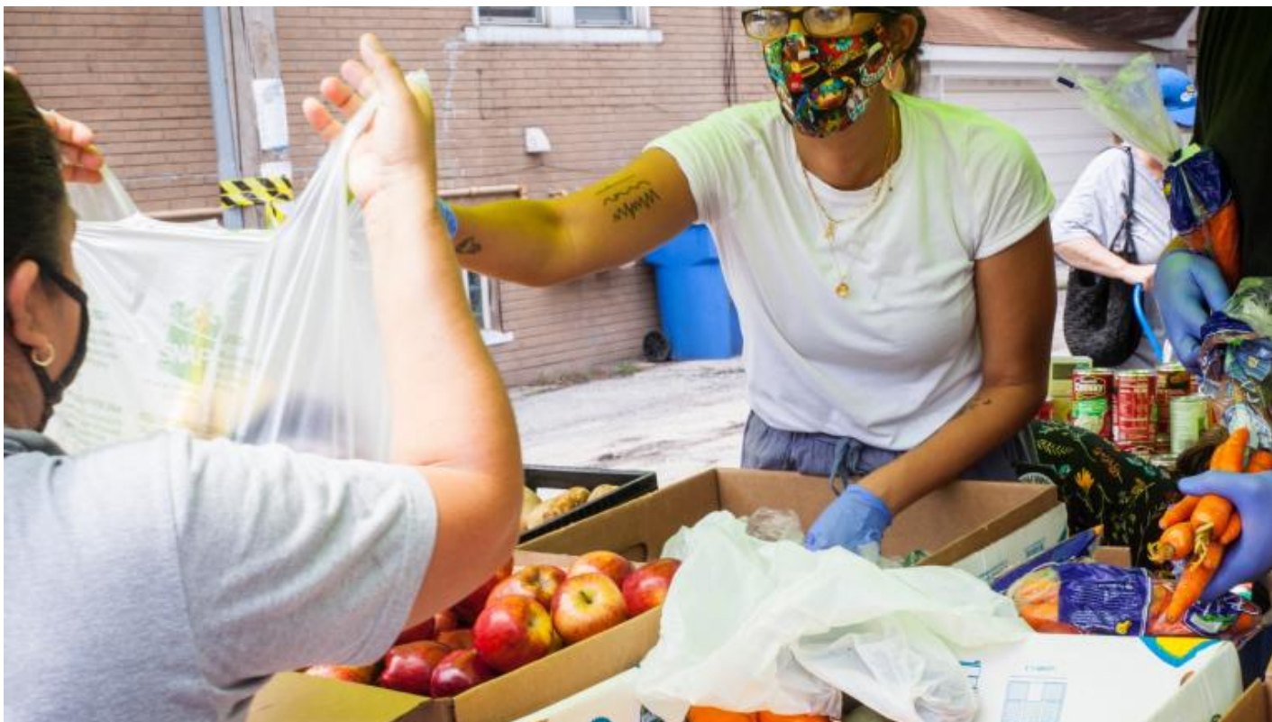
(/2021/02/18/chicago-volunteer-expo-aims-draw-thousands-its-weekend-event-virtually-course) Chicago Volunteer Expo Aims To Draw Thousands To Its Weekend Event — Virtually, Of Course (/2021/02/18/chicago-volunteer-expo-aims-draw-thousands-its-weekend-event-virtually-course)