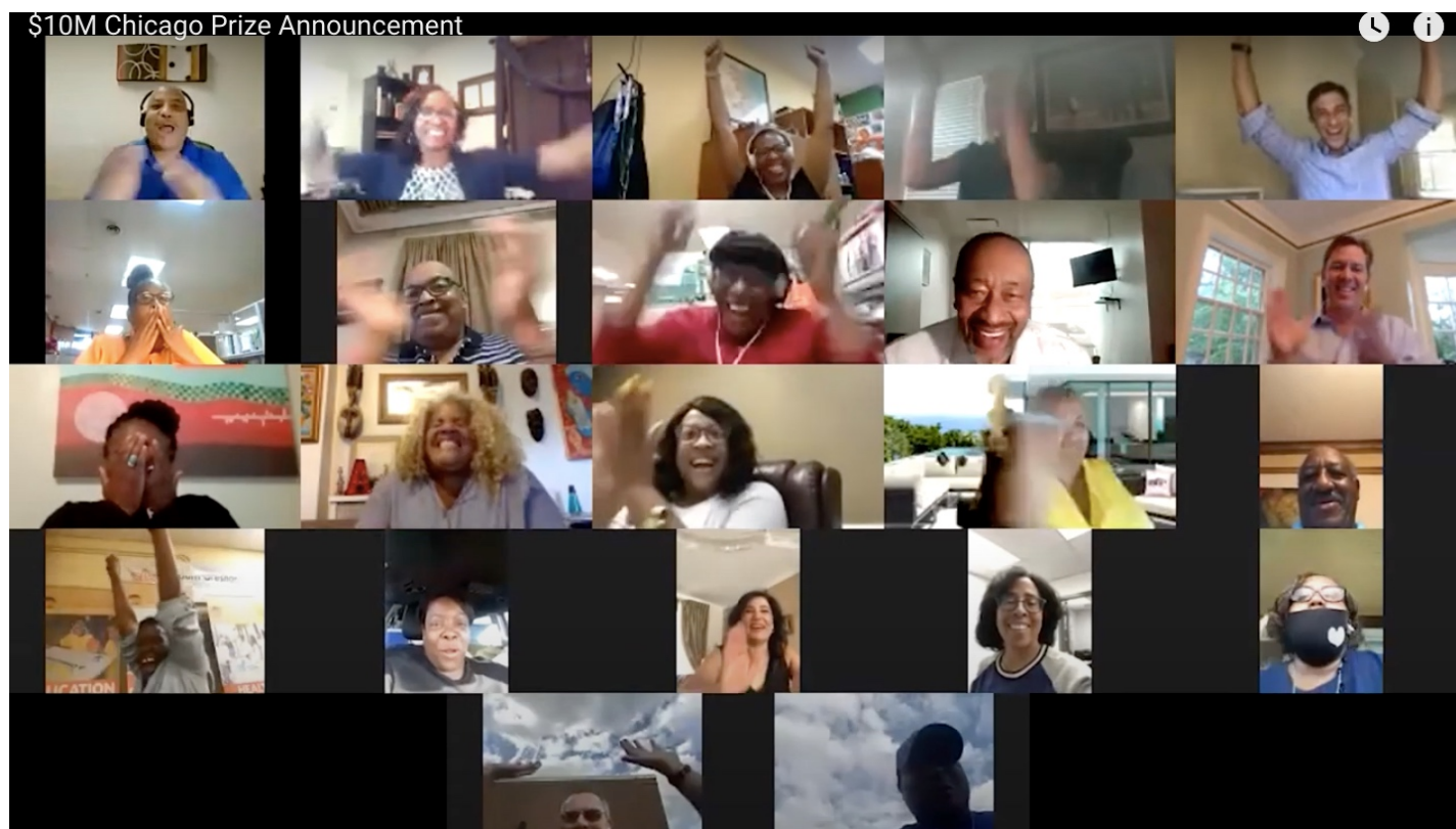
The Always Growing, Auburn Gresham team getting the good news of their Chicago Prize win on a Zoom call.