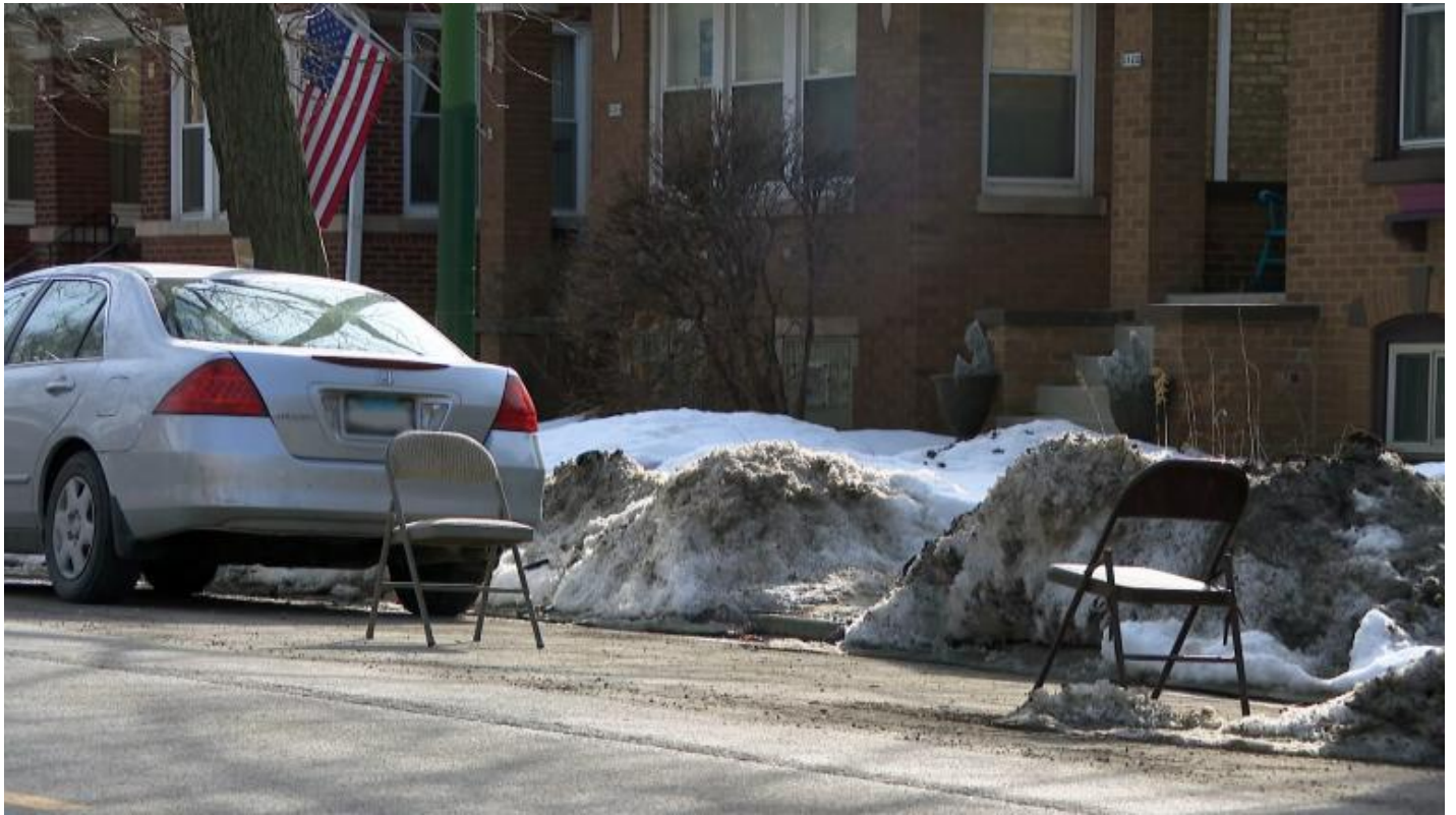
(/2021/02/25/time-s-dibs-city-says-clear-your-stuff-or-it-ll-get-tossed) Time's Up on Dibs, City Says. Clear Your Stuff or It'll Get Tossed (/2021/02/25/time-s-dibs-city-says-clear-your-stuff-or-it-ll-get-tossed)