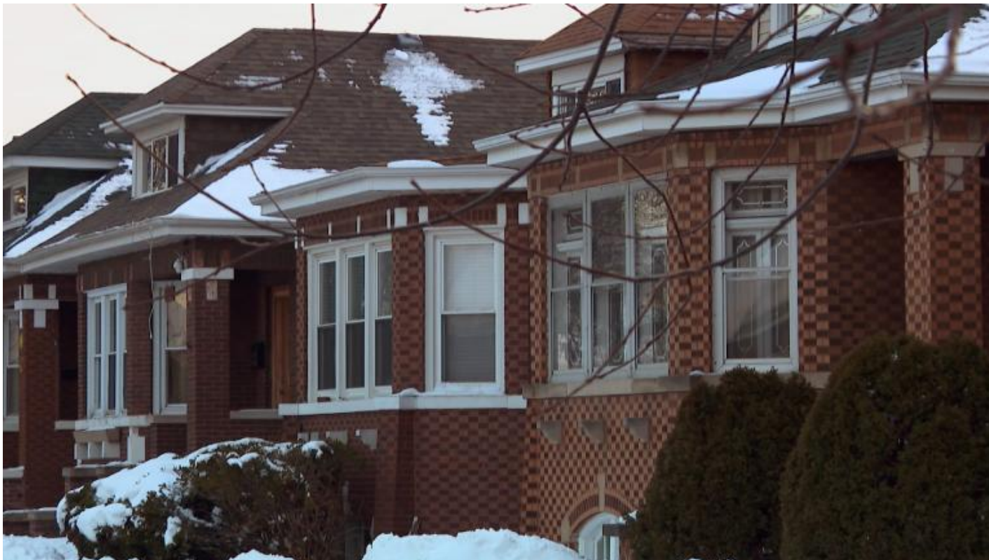
(/2021/02/04/gage-park-historic-bungalow-district-added-national-register-historic-places) Gage Park Historic Bungalow District Added to National Register for Historic Places (/2021/02/04/gage-park-historic-bungalow-district-added-national-register-historic-places)